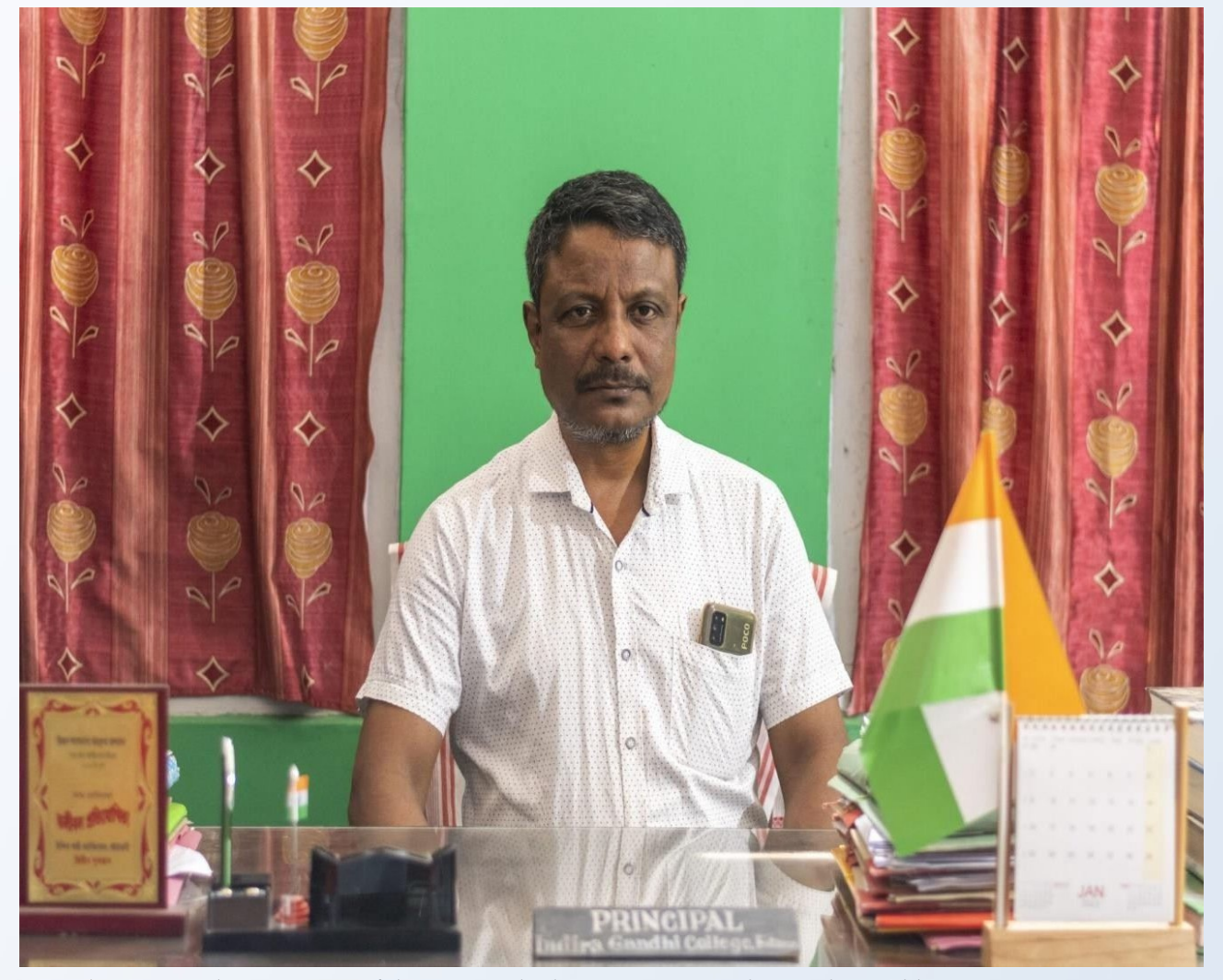
"Education is the most powerful weapon which you can use to change the world."